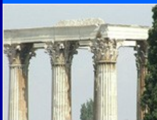
Athens, Ancient Corinth